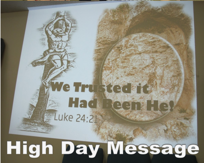
High Day Message