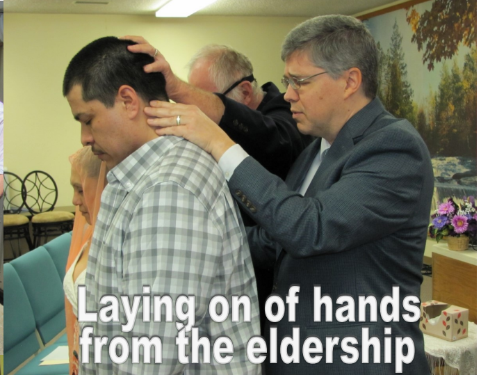
Laying on of hands from the eldership