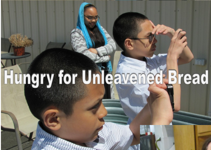
Hungry for Unleavened Bread