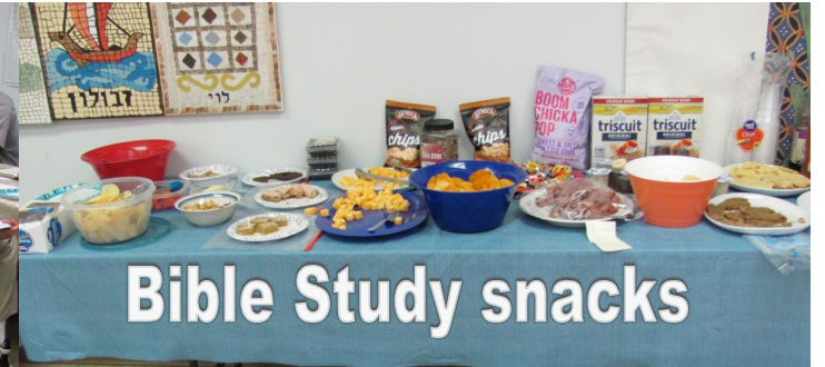
Bible Study snacks