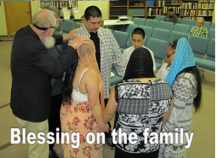
Blessing on the family