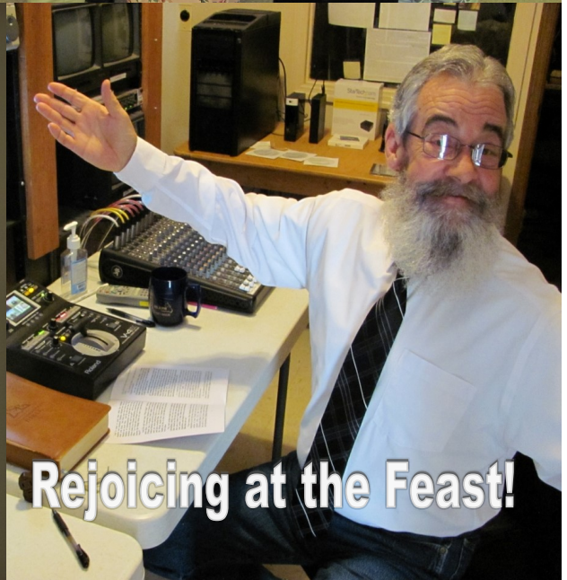
Rejoicing at the Feast!