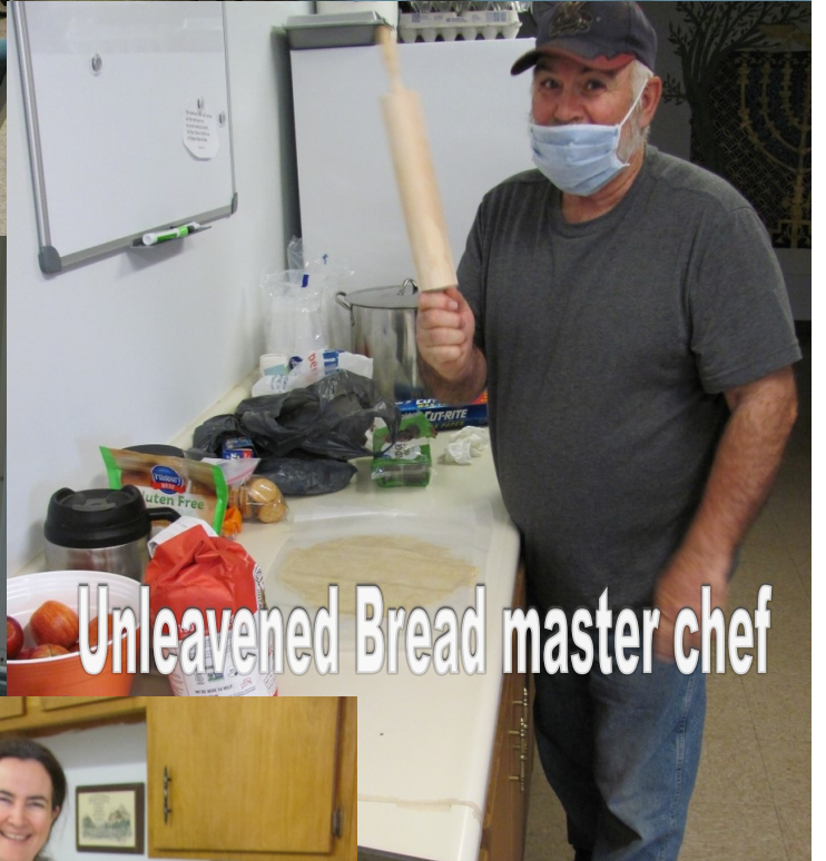
Unleavened Bread master chef